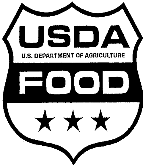
USDA Symbol - Optional

Frozen Peaches Sliced 20 pounds Purchase Order Number xxxxx